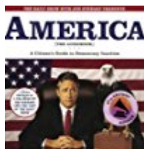
America (The Book) [Audio CD]