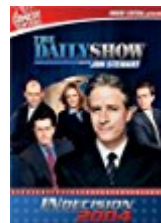
The Daily Show with Jon Stewart: Indecision 2004 [DVD]